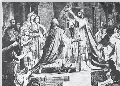
Pope Stephen II Crowning King Pepin A.D.

Within a few hundred years after Christ's death, everything was changed. Instead of suffering, came honor; instead of humility, came pride; instead of truth, came error; and instead of being persecuted, the church became the persecutor of all who did not adhere to her dictates. Soon she began to invent new doctrines to justify her course, declaring that the promised millennial reign of Christ had come, and that he was represented by her popes, who reigned over the kings of the earth as Christ's vicegerents. Her claims were successful in deceiving the whole world. She made all nations drunk with her erroneous doctrines - teaching that eternal torment awaited all who resisted her